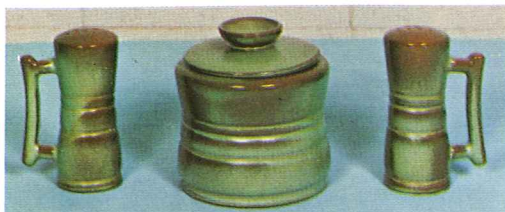
26G—SUGAR/GREASE 8.50 26H—SALT & PEPPER 6.00 4-PIECE SET/BOXED 14.50