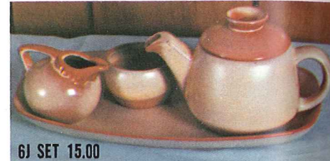
6J SET 15.00