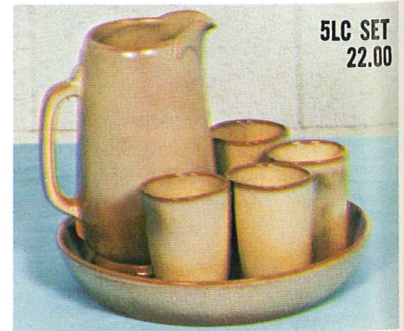
5LC SET 22.00 81—1 QT. PITCHER 6.00 5LC—6 OZ. JUICE 3.00 91—TRAY 4.25