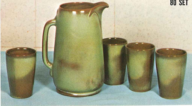
80—8 QT. PITCHER 8.50 5L—12 OZ. TUMBLER 3.50