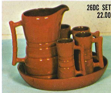
26DC SET 22.00 26D—1 QT. PITCHER 6.00 26DC—3 OZ. JUICE 3.00 91—TRAY 4.25