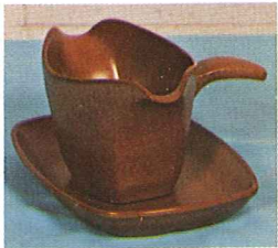
6S—TWO-SPOUT GRAVY 6.00 5PS—9" PLATTER-TRAY 3.50 6S/ST—TWO-SPOUT GRAVY/W TRAY 9.50