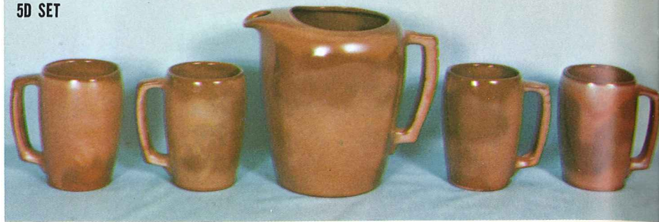
5D—3 QT. PITCHER 10.00 5M—16 OZ. MUG 4.00