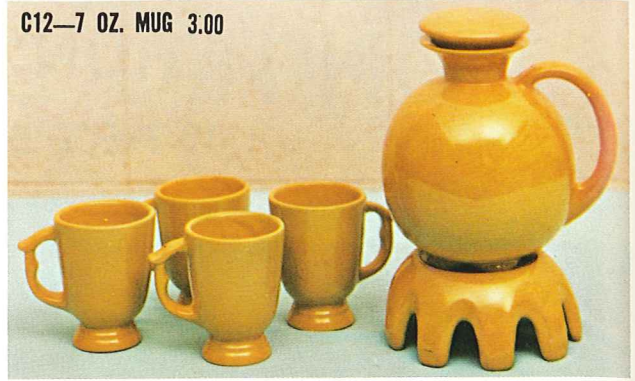
82 SET (82—6 CUP CARAFE & LID 82W—WARMER) 18.00