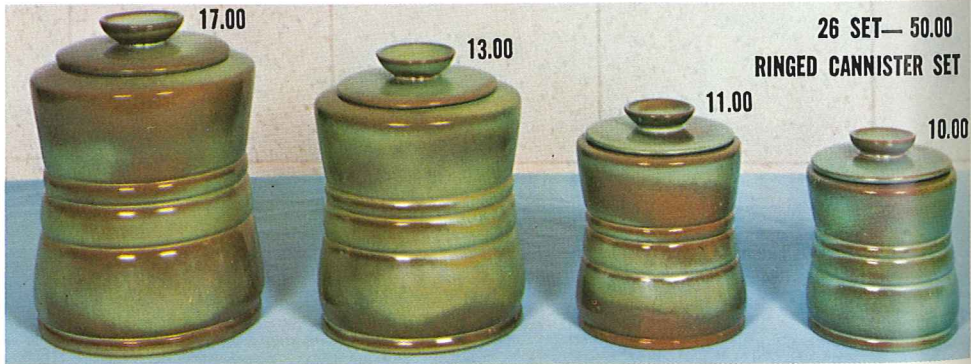
26 SET— 50.00 RINGED CANNISTER SET 26F—17.00 26S—13.00 26C—11.00 26T—10.00 26F—FLOUR, COOKIES, CORN MEAL 26S—SUGAR 26C—COFFEE 26T—TEA