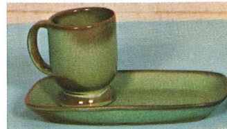
COFFEE AND DESSERT SET 5PS—9" PLATTER-TRAY 3.50 C2—10 OZ. MUG 3.00 (or choose your own style Mug — See Pg. 9)