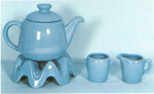
6T—6 CUP TEAPOT 8.50 5DA—6 OZ. CREAMER 3.00 WA3—6" WARMER W/CANDLE 4.50 5DB—6 OZ. SUGAR 3.00